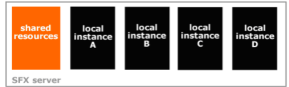
Figure 3: Multiple SFX Instances - Including One Instance for Shared Resources